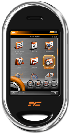
Figure: FIC Neo1973