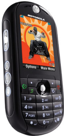
Figure: ROKR E2